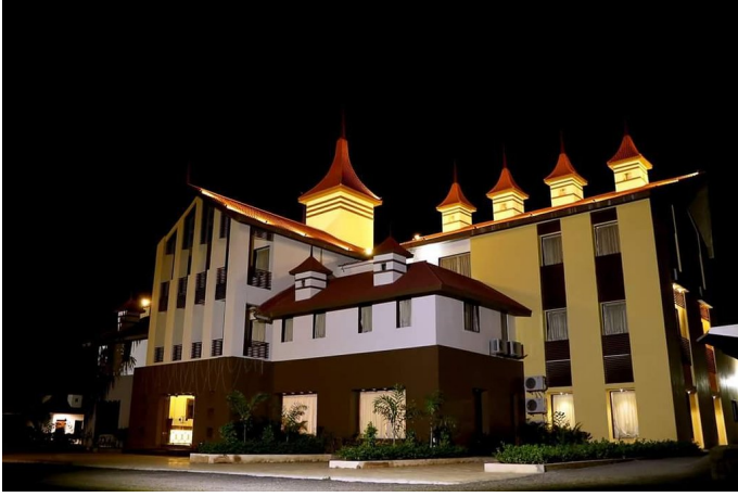
SASAN GIR WOODS AT SASAN