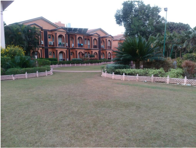
DIU RADHIKA RESORT